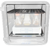
RS2 BS-010425-HK rack for CPS-20 / CTR-6 installation