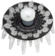
R-0.5/0.2M BS-010201-BK rotor

Rotor for 12 × 0.5 ml and 12 × 0.2 ml microtest tubes