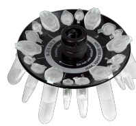
R-2/0.5/0.2 BS-010205-DK rotor

Rotor for 8 x 2/1.5 ml and 8 x 0.5 ml microtest tubes