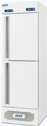
Model: HC6-400S- —