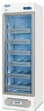
Model: HR1-400S- —