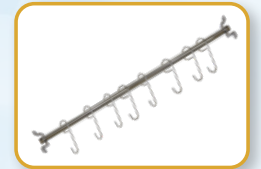
Stainless Steel IV Bar