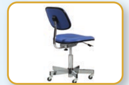
Ergonomic Lab Chair