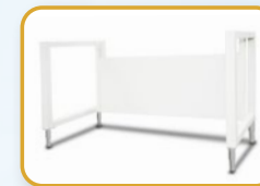
Support Stand with Levelling Feet (28 and 34 in)