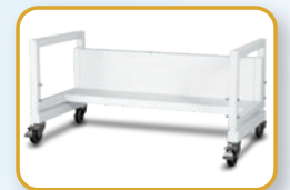
Telescopic Support Stand