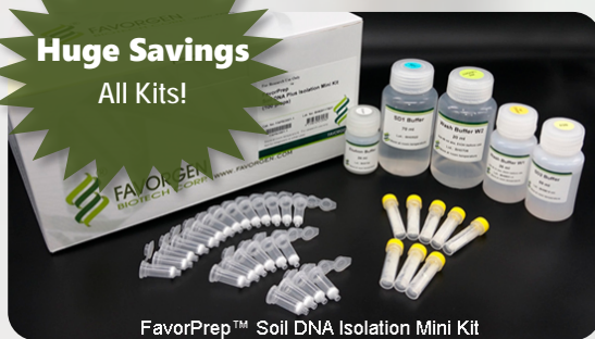
FavorPrep™ Soil DNA Isolation Mini Kit