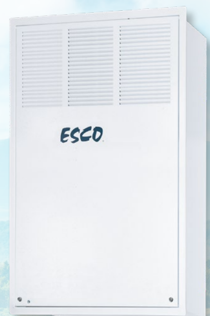
Esco Ceiling Air Purifier