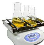
PSU-10i Without platform Orbital Shaker

Flat platform with non-slip silicone mat for Petri dishes, culture flasks, agglutination cards.