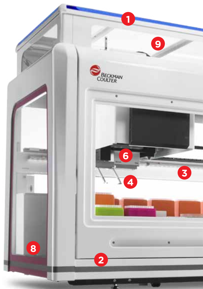
Biomek i7 Automated Workstation