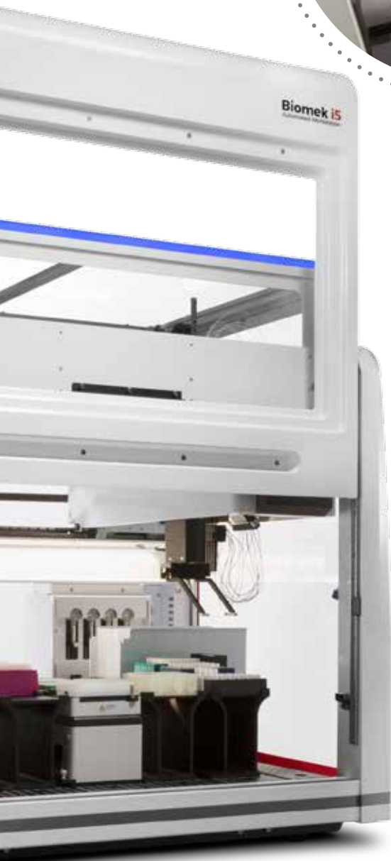
Biomek i5 Automated Workstation