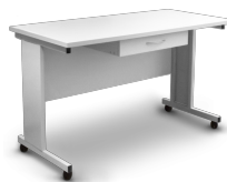
T-4L BS-040107-BK Table

New modular design of laboratory furniture provides flexibility and ease of use.