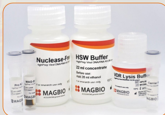
HighPrep™ Viral DNA/RNA Kit (HPV-DR-96)