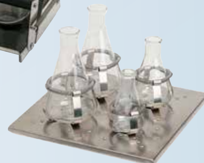
S2031-18 (clamps sold separately)