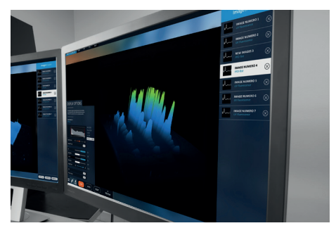
The Quantum delivers more significant quantitative data compared to other imagers.