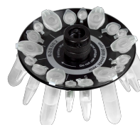
R-2/0.5/0.2 BS-010205-DK rotor

Rotor for 8 x 2/1.5 ml and 8 x 0.5 ml microtest tubes