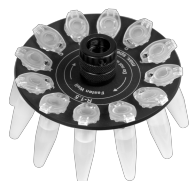
R-1.5 BS-010205-AK rotor

Rotor for 12 x 0.5 ml and 12 x 0.2 ml microtest tubes