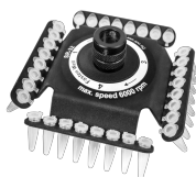
SR-32 BS-010205-FK rotor

Rotor for 2 x 8-section 0.2 ml microtube strips