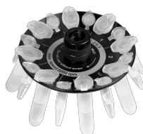
R-2/0.5 BS-010205-CK rotor

Rotor for 8 x 2/1.5 ml and 8 x 0.5 ml microtest tubes