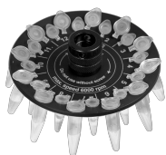
R-0.5/0.2 BS-010205-BK rotor

Rotor for 12 x 0.5 ml and 12 x 0.2 ml microtest tubes