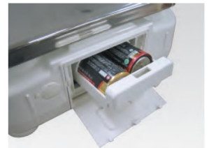
The battery box makes it quick and easy to replace batteries.