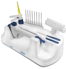
HAS-1 BS-040118-PK Hand operator set