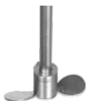
MP-2 Propeller stirrer 2 folded blades (ø 60mm)