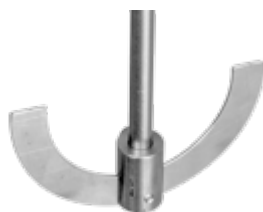
MA-1 Anchor stirrer (ø. 90 mm, height 48 mm)