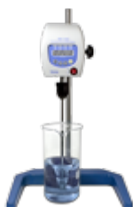
Rod and base