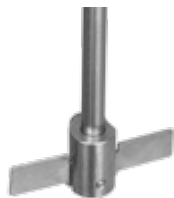
MC-1 Centrifugal stirrer (ø 60 mm)