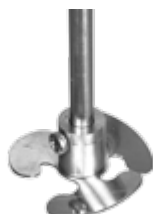
MP-3 Propeller stirrer 3 folded blades (ø 50mm)