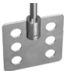
MP-1 Paddle stirrer (70 x 70 mm)