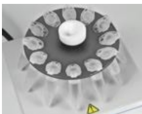
R-1.5M rotor for 12 x 1.5/2 ml microtest tubes