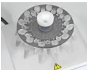
R-0.5/0.2M rotor for 12 x 0.5 ml and 12 x 0.2 ml microtest tubes