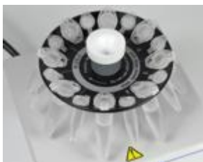
R-2/0.5 rotor for 8 x 2/1.5 ml and 8 x 0.5 ml microtest tubes