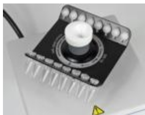
SR-16 rotor for 2 x 8-section 0,2 ml microtube strips