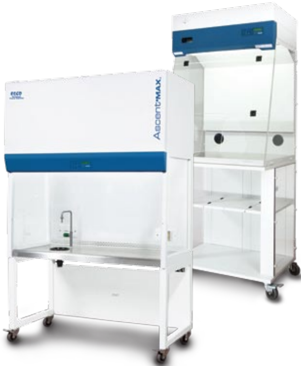
(Left to Right) Esco Ascent™ Max Ductless Fume Hood and Esco Ascent™ Opti Ductless Fume Hood