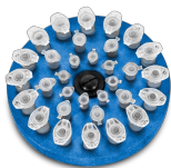
PV-32 BS-010207-CK platform