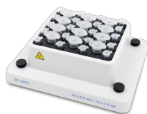
SC-18/02 BS-010120-CK block

20 × 0.2 ml microtubes + 12 × 1.5 ml microtubes