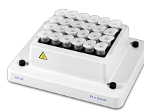
SC-24 BS-010120-EK block