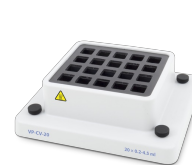
VP-CV-20 BS-010175-IK block