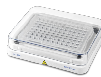
SC-96A BS-010120-FK block

96-well unskirted or semi- skirted microplate (0.2 ml) for PCR or 12 × 8 - 0.2ml strips or 96 tubes of 0.2 ml.