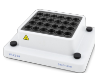
VP-CS-24 BS-010175-LK block