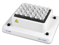
SC-24N BS-010120-GK block

20 × 0.2 ml microtubes + 12 × 1.5 ml microtubes