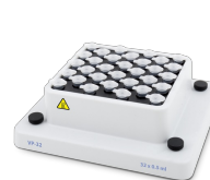
VP-32 BS-010175-JK block