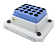
VP-20 BS-010175-TK block