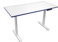
LT-180 BS-040107-HK Height adjustable desk