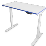
LT-120 BS-040107-EK Height adjustable desk