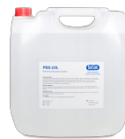
PDS-10L BS-040107-FK DNA/RNA Decontamination Solution 10l