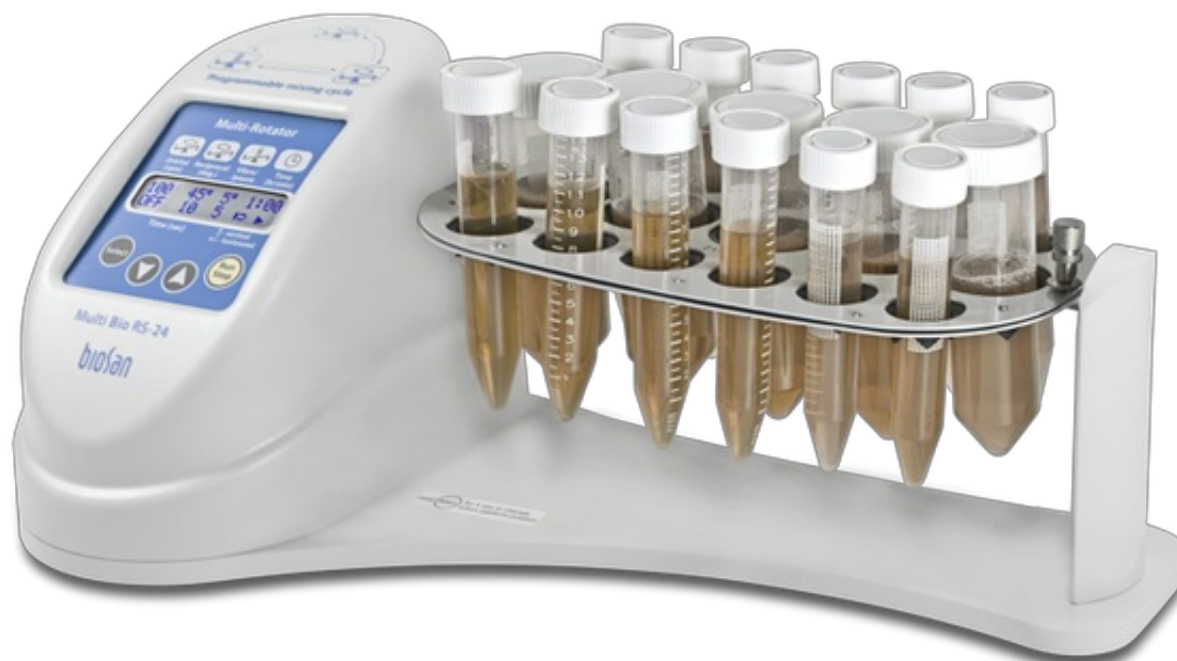
Multi Bio RS-24 Including PRS-26 platform Programmable rotator