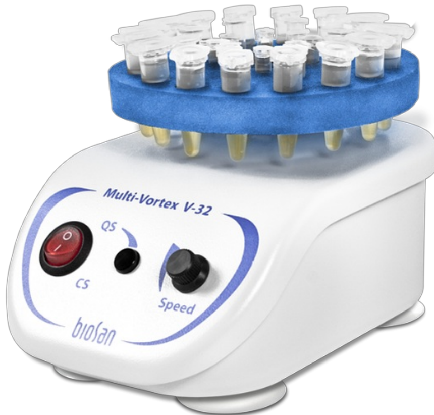
V-32 Including two platforms PV-32, PL-1 Multi-Vortex

Multi-Vortex V-32 is intended for intensive stirring of bacterial and yeast cell, washing from the culture medium and extraction of metabolites and enzymes from cells and cell cultures.