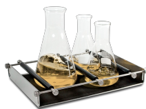
UP-12 BS-010108-AK platform

Universal platform with adjustable bars for different types of flasks, bottles, and beakers with silicone mat.