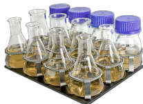
P-12/100 BS-010108-EK platform

Flat platform with non-slip silicone mat for Petri dishes, culture flasks, agglutination.