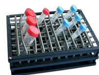
P-16/88 BS-010116-BK platform

Platform with spring holders for up to 88 tubes up to 30 mm diameter (e. g. 10 ml, 15 ml, 50 ml tubes).