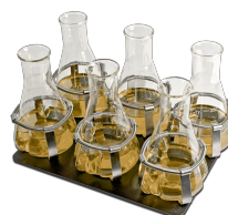
P-6/250 BS-010108-DK platform