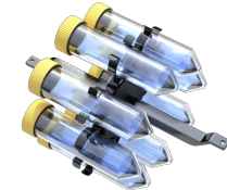
RP-8/50 BS-010117-KK roller platform

Roller platform, 8 tubes (15 ml). 5° incline for enhanced mixing homogeneity.