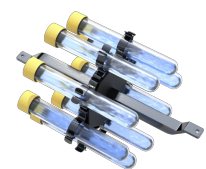
RP-8/15 BS-010117-DK roller platform

Platform for microplates and racks for tall tubes 0.5 and 1 ml (e.g. Thermo 3741MTX, 3742MTX, 3744MTX).