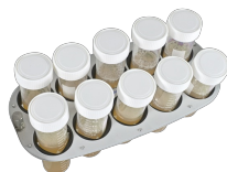
PRS-10 BS-010117-IK platform

5 tubes 20–30 mm diameter (50 ml tubes) and 12 tubes 10–16 mm diameter (1.5–15 ml tubes).