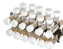
PRSC-22 BS-010117-LK platform

10 tubes 20–30 mm diameter (up to 50 ml tubes).