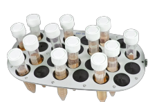
PRS-26 BS-010117-GK platform

Can accommodate 26 tubes 10–16 mm diameter (1.5–15 ml).