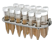
PRS-5/12 BS-010117-HK platform

Can accommodate 26 tubes 10–16 mm diameter (1.5–15 ml).