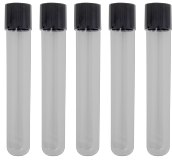
Glass test tubes 16mm BS-050102-MK

Glass Test Tubes 16x100mm, high borosilicate, PP Cap with silicone pad. Packing - 100 pcs/box