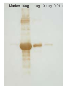
Figure 1. Western Blot

Immunoblot Analysis Marker (lane 1), 10 ug (lane 2), 1 ug (lane 3), 0.1 ug (lane 4), 0.01 ug (lane 5) of BSA samples were resolved by electrophoresis, blotted to nitrocellulose, and probed with Anti-BSA (1:4,000). Proteins were visualized with goat anti-rabbit secondary antibody conjugated to HRP (1:5,000) and DAB substrate. Arrow indicates BSA (69 kDa).