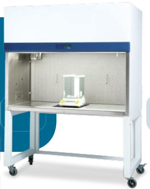
Labculture Reverse Horizontal Flow Cabinet Model RHL-4A. Shown with optional support stand.